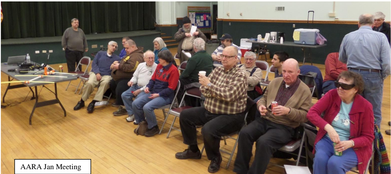
AARA Jan Meeting