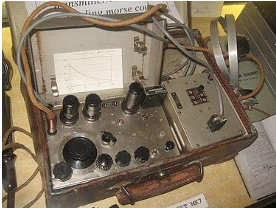
Paraset Mk. 7 Radio at The Bletchley Park Museum