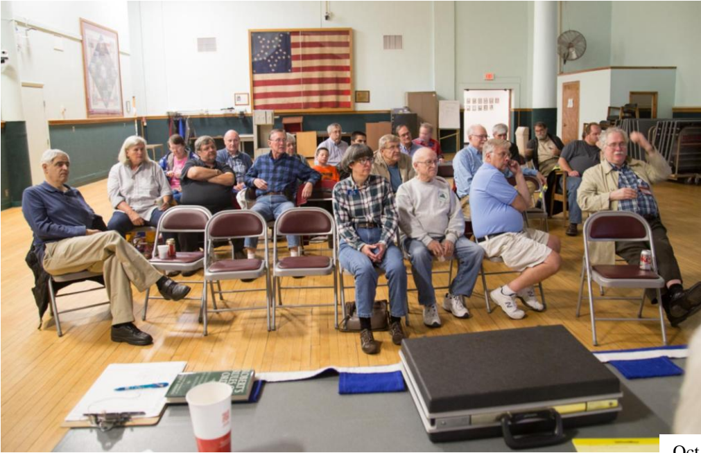
Oct 2015 AARA Meeting