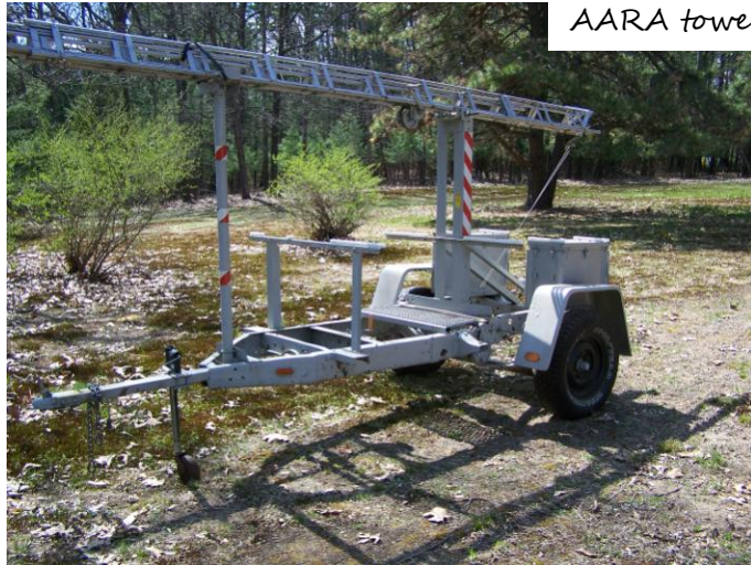
AARA tower trailer