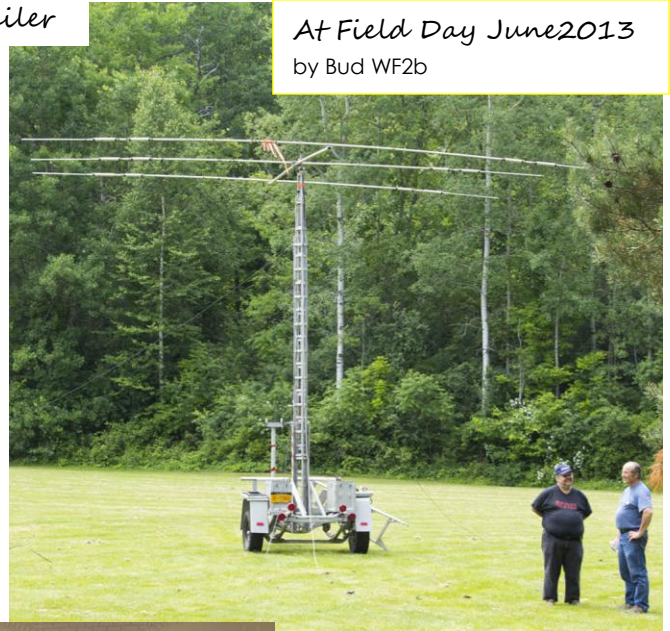
At Field Day June 2013 by Bud WF2b