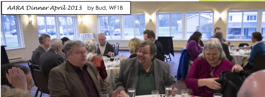
AARA Dinner April 2013

ATVET Albany Troy Volunteer Examiner Team