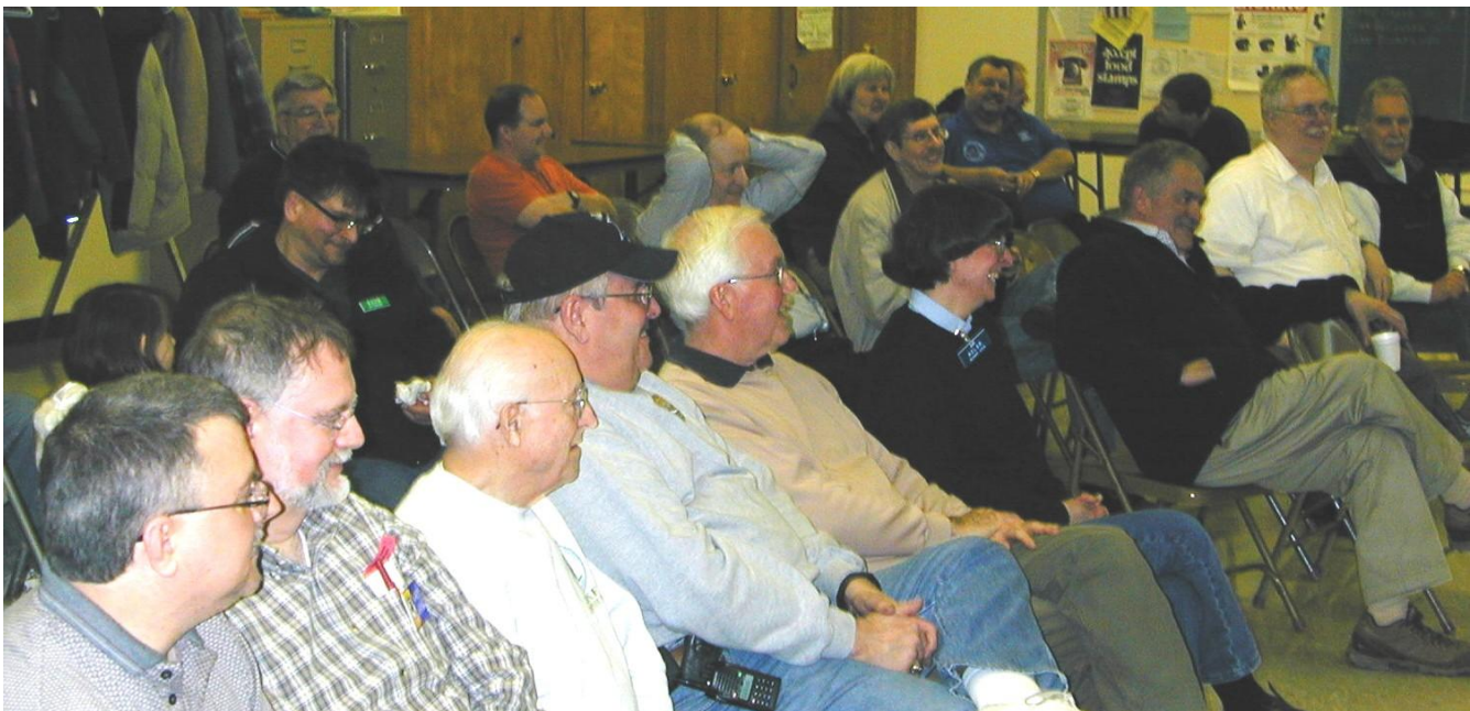
AARA March Meeting 2010

AARA MAY Meeting MAY 7 th the first Friday of the month