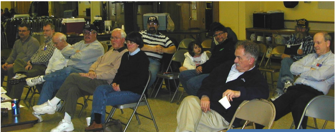
At the AARA March Meeting 2010

The Times and Dates listed below were last updated on 3/1/2010. Please, keep in mind that from time-to-time the schedule gets changed as the season goes on. We recommend that you check back here often to confirm the dates/times you're interested in haven't been changed/canceled.