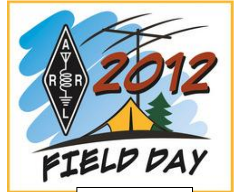
Field Day pin

You've spent all year preparing for ARRL Field Day , but there are still a few things you're missing: The official 2012 Field Day shirt, hat, pin and logbook! ARRL Field Day -- Amateur Radio's largest on-the-air operating event -- is just a little more than two months away, so be sure to get your gear before supplies run out. This year's ARRL Field Day shirt is a khaki T-shirt that sports the 2012 Field Day logo atop a pocket, with the ARRL diamond logo and "Ham Radio" on the back. Shirts are available in sizes Small-4XL. The hat -- which has "Field Day" emblazoned on its front -- is Texas Orange and is color-coordinated with this year's logo. New for 2012 is the ARRL Field Day Logbook . This nifty logbook is set up in the Field Day reporting format and includes dupe sheets and other forms that you need to have to ensure a successful Field Day. Clubs, order early! Collect orders from members and place a single order -- pay only $12.50 shipping for orders over $50 (while supplies last). ARRL Field Day is June 23-24, 2012. Fulfill all your Field Day apparel needs at the