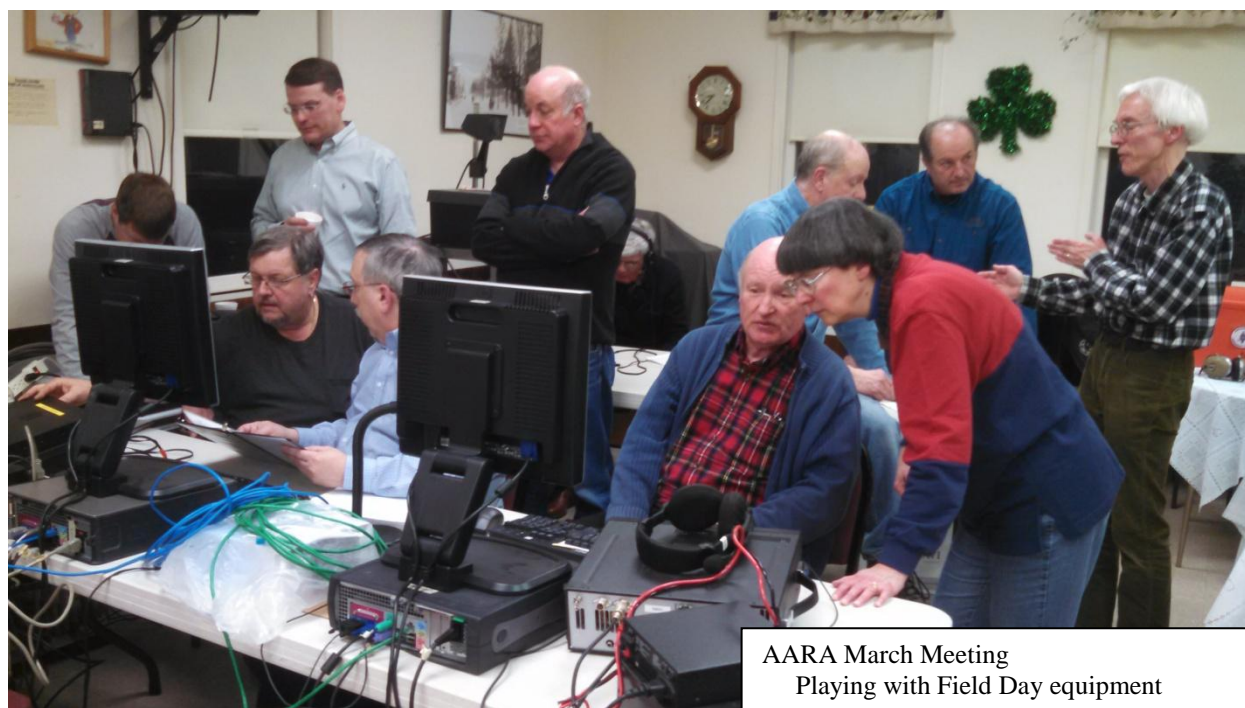
AARA March Meeting Playing with Field Day equipment