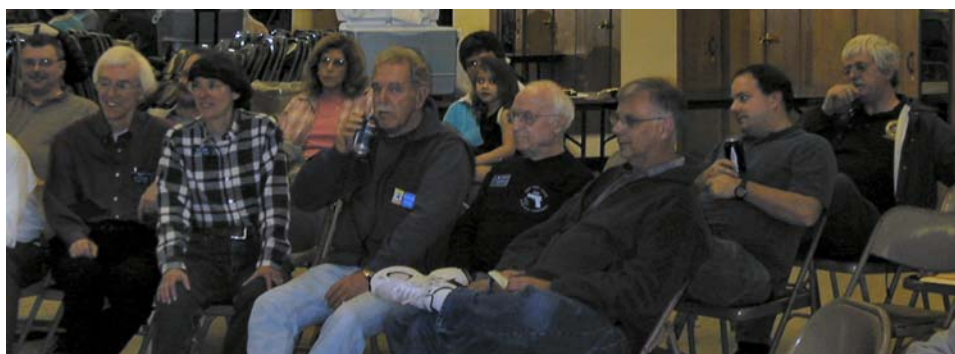
Nov 2008 Meeting