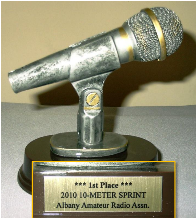
AARA Trophy for 2010 AARA Sprint

Are You Changing Your Address: Please contact Walt, WA1KKM 456-3637 or via e-mail sue.walt@verizon.net with your address corrections