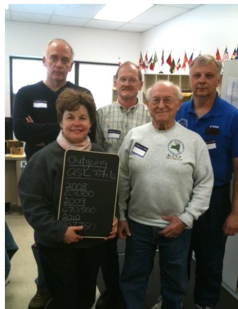
K2XF, K2BX, N1JP, and K2EP visit the out-going QSL service department on their January trip to Newington.

In March we are back at the Voorheesville Library , then the April Dinner. May we should be in our new permanent location at the Bethlehem town hall.