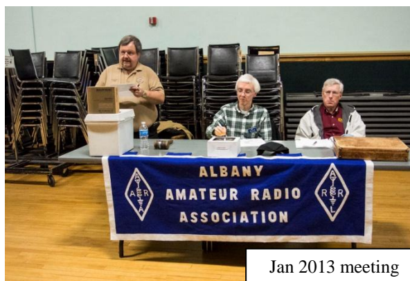
Jan 2013 meeting

Extreme - the next time you try to explain ham radio contesting, try calling it "Extreme Wireless". With all the "extreme" sports on the TV channels, the characterization of radiosport as an extraordinary form of something they already know about might make a connection with your audience.