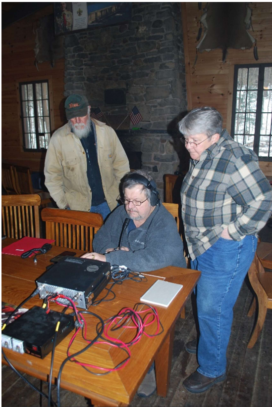
Winter Field Day 2020