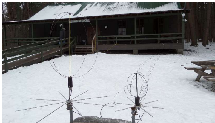
Winter FD 3