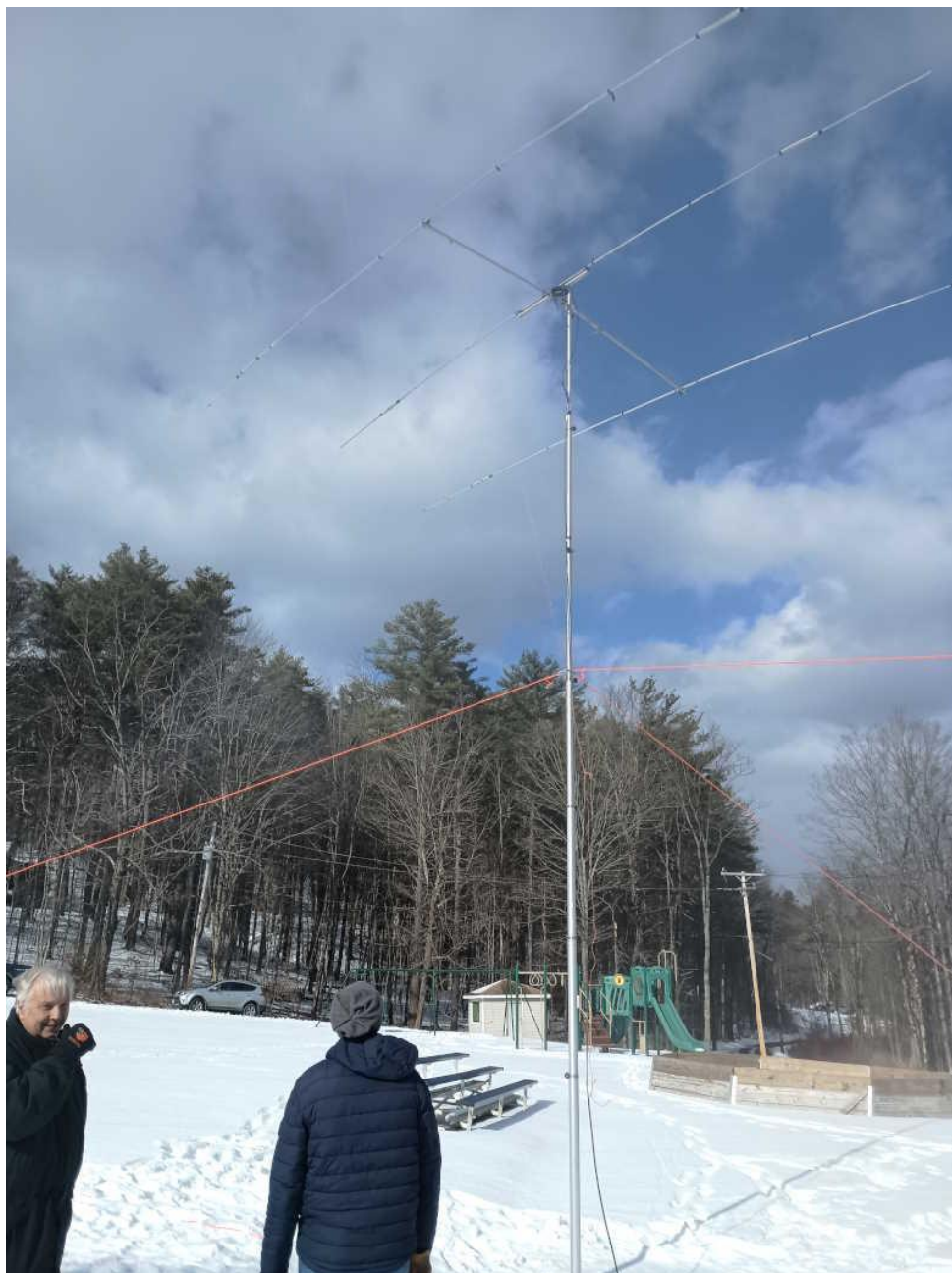
Tri Bander Beam on Push-Up Mast