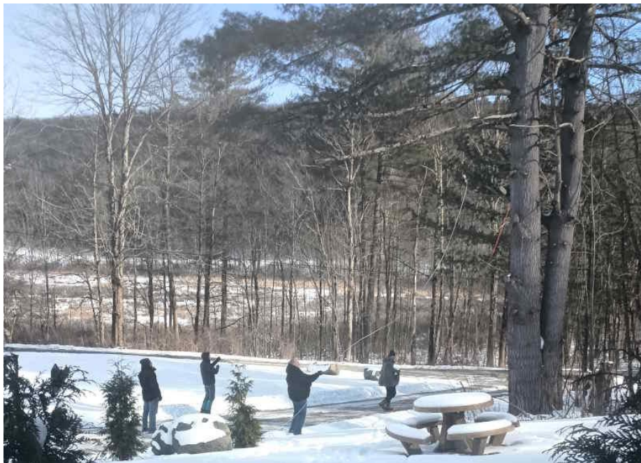
Installing a Wire Antenna