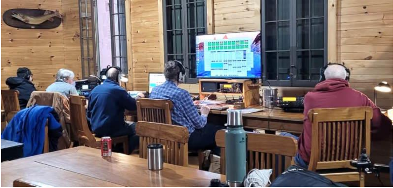
K2ALB Stations in Operation