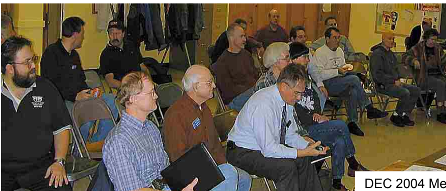
DEC 2004 Meeting