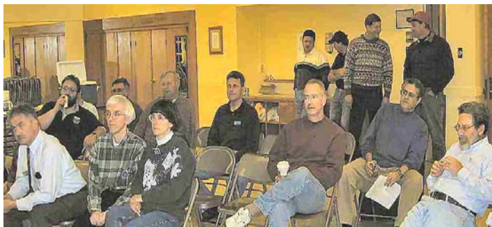
DEC 2004 Meeting