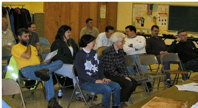
Dec. 2005 Meeting