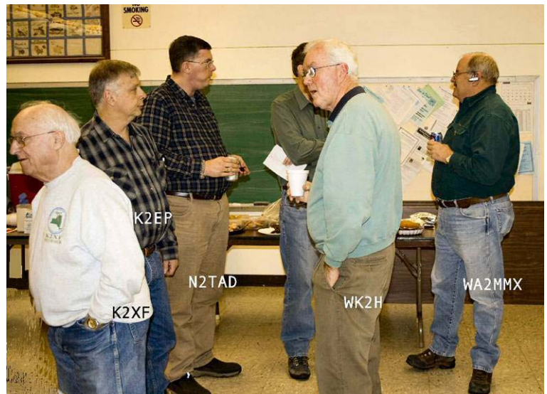
a gathering at the Dec 2007 meeting