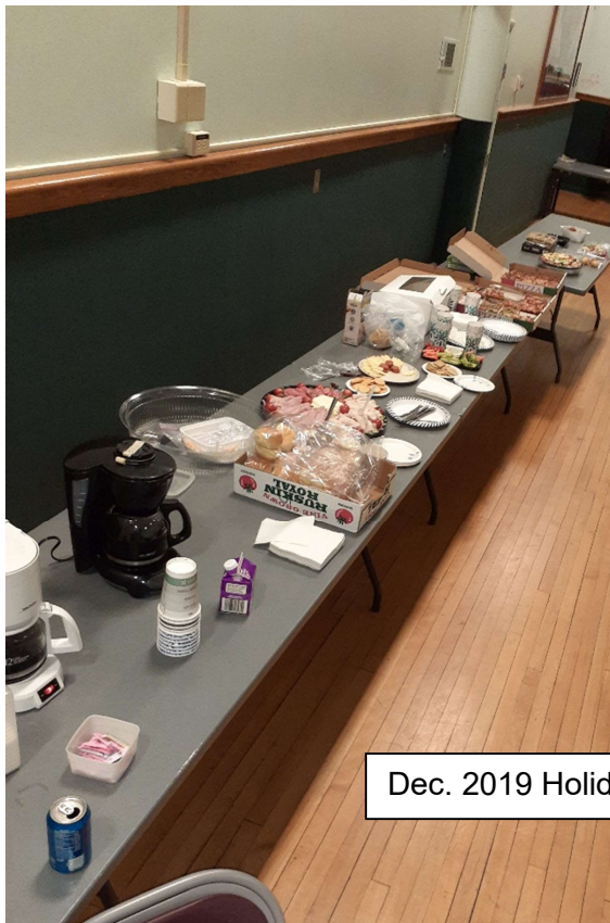
Dec. 2019 Holiday Get Together