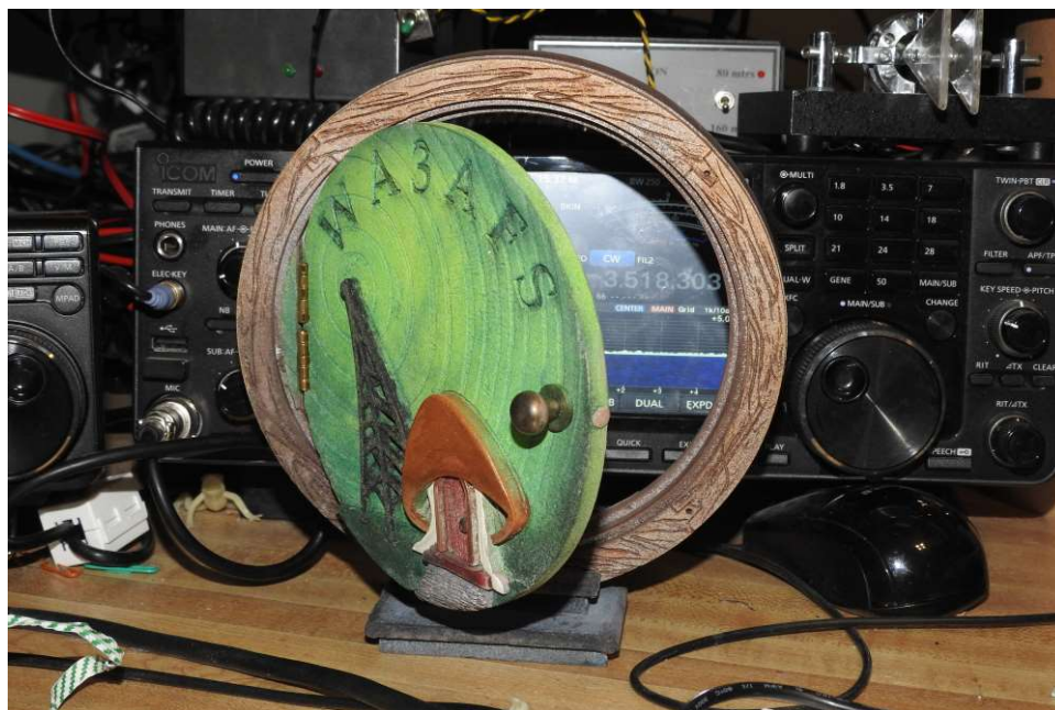
Submitted by WA3AFS