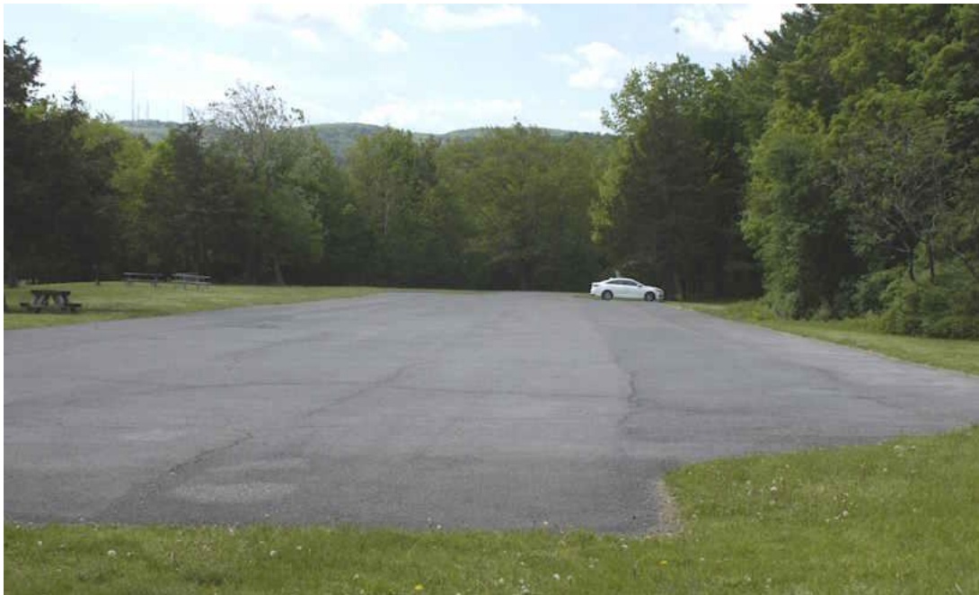
Plenty of Parking for Operators and Guests