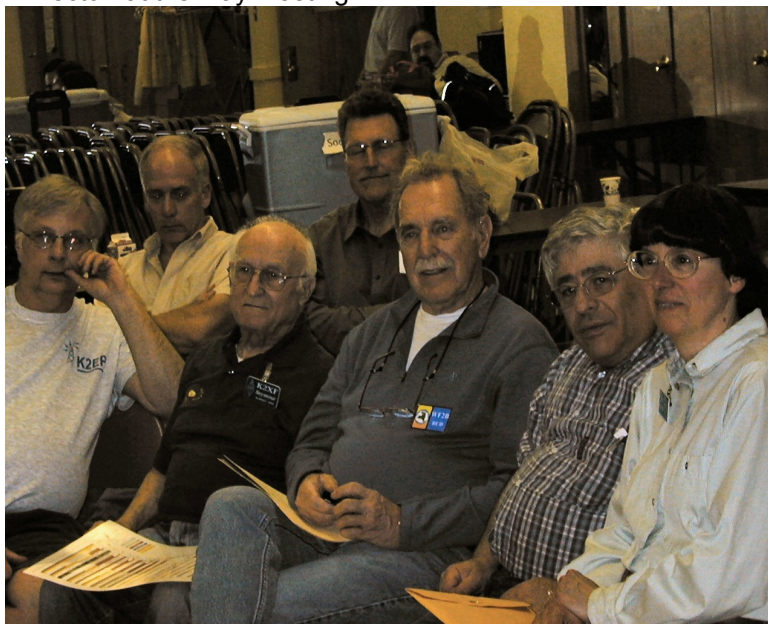
K2EP, K2BX, K2XF, W2UV, WF2B, WA3AFS, N2LBR