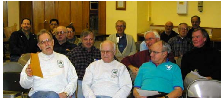
meeting Feb 2003

includes: Internal AT-440 Automatic Antenna Tuner: 80-10meters, 2.1KHz International Radio SSB filter, MFJ Deluxe Versa Tuner II model # MFJ-948: 160-10meters, Hand mike, Power cord, & Instruction manual with schematics All works well: Asking $400 Contact Scott, N2MQQ 518-725-9123 x0960636@capital.net