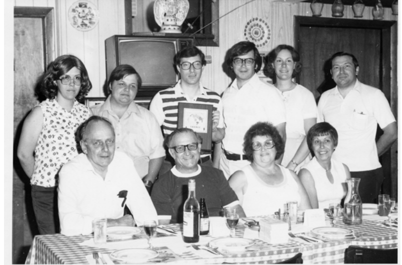
Who are these AARA members?