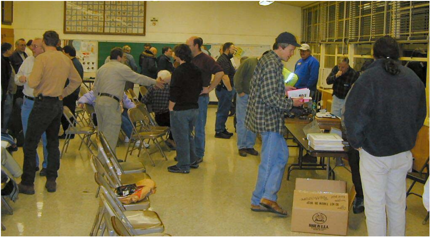
FEB 2006 AARA Club Flea Market