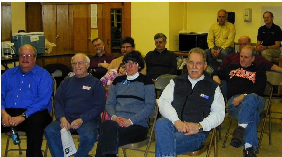
Feb 2010 AARA Meeting