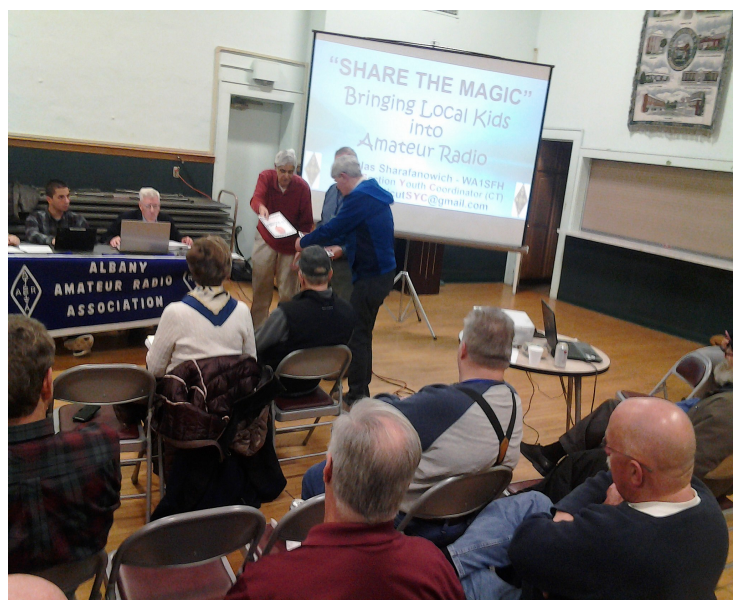
The Feb. program