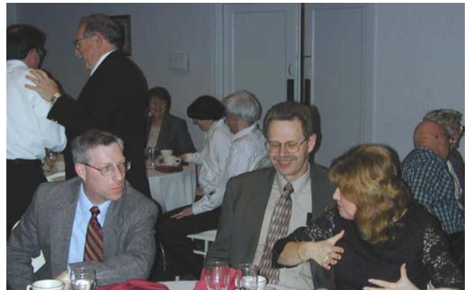
AARA Dinner April 2003