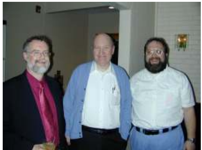
April 2006 AARA Dinner Pics