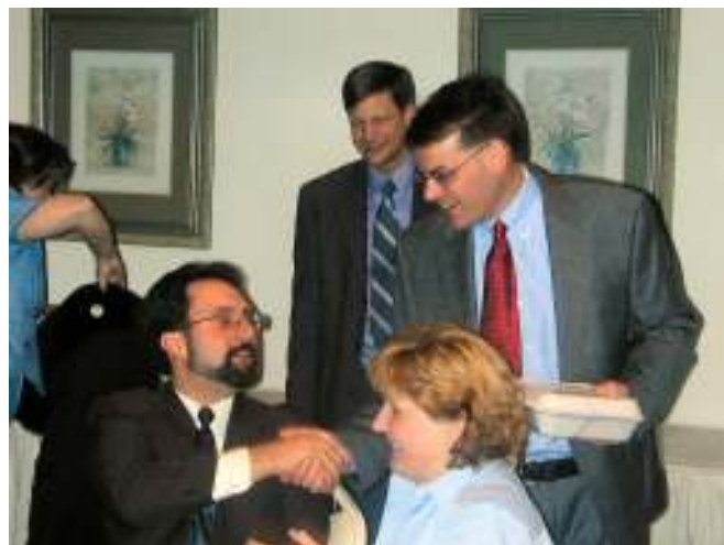
At the April AARA Dinner More pics online at www.K2CT.net