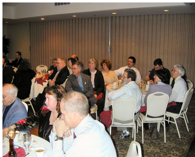
At the April AARA Dinner 2007