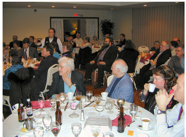
At the AARA Dinner April 2007