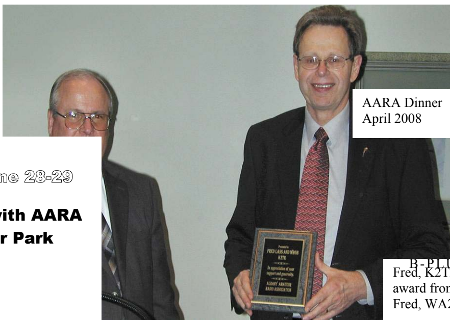
AARA Dinner April 2008