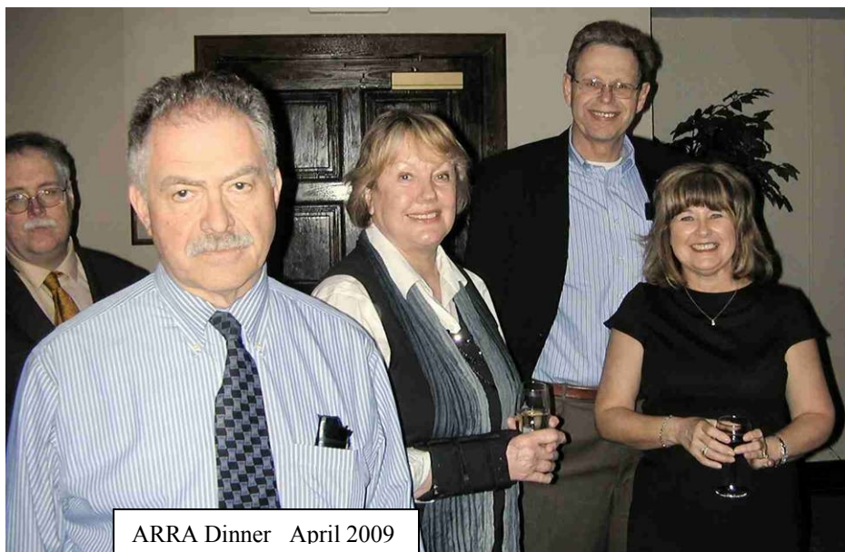
ARRA Dinner April 2009