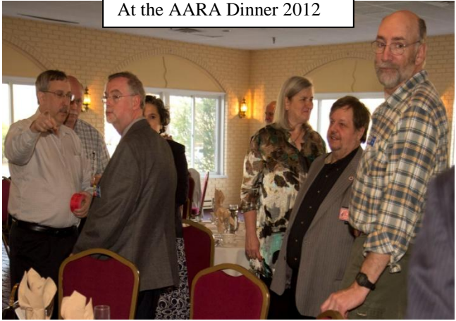
At the AARA Dinner 2012