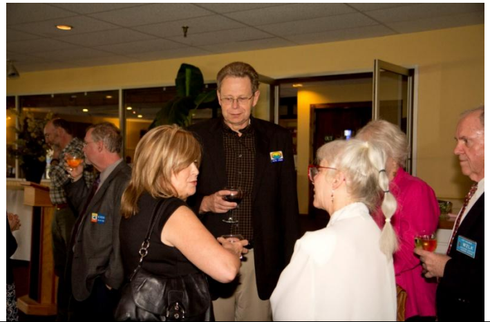
AARA Dinner 2012