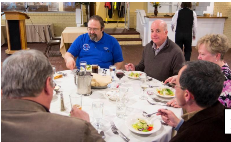
Around the table AARA 2013 Dinner