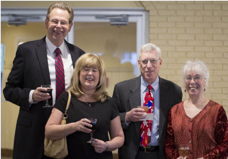
At the AARA Dinner 2013