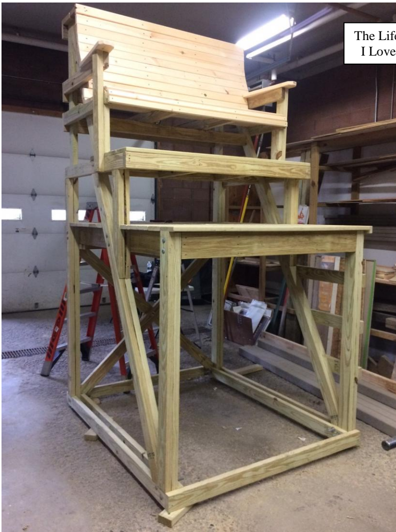
The Lifeguard Chair I Love My Park 2017

See you all at Field Day June 24 th 2017 (Haile's Cave), where you can check out the new visitors center and other attractions that have been added to the park. KB2HPX