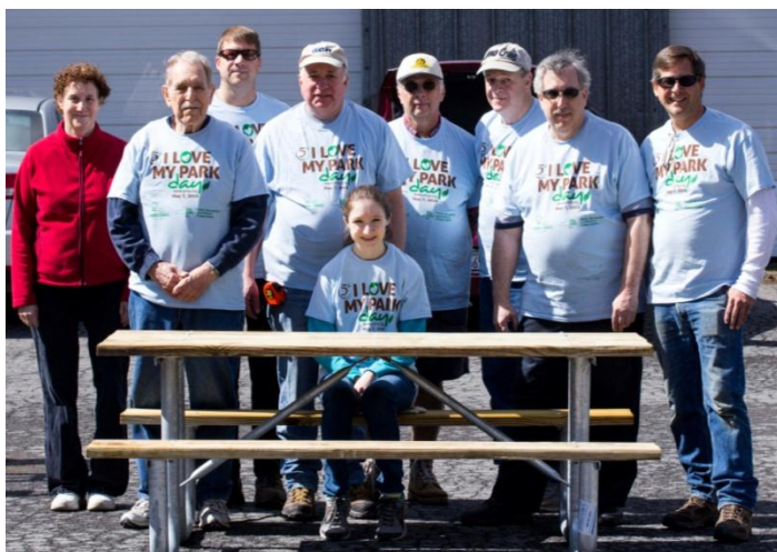
AARA at the "I Love My Park 2016" Thatcher State Park May 7 th We built Picnic tables