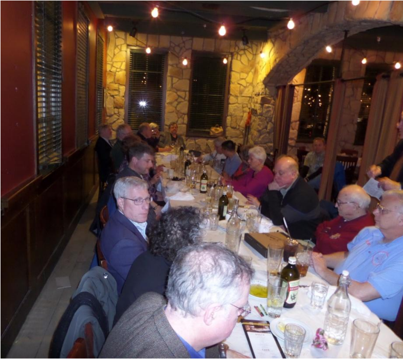
Looking down the table at the AARA Dinner 2016