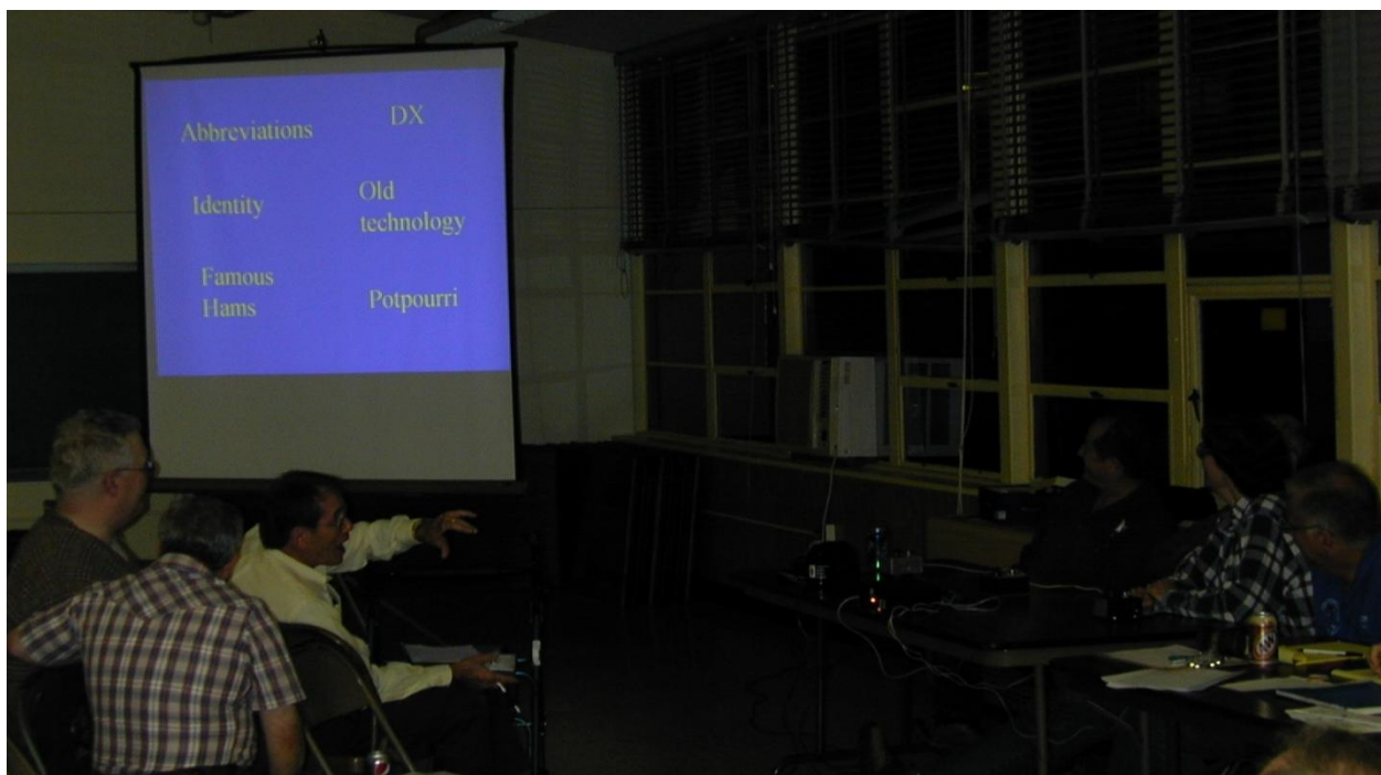
"Quiz Game" Played at the Oct 2010 meeting

Are You Changing Your Address: Please contact Walt, WA1KKM 456-3637 or via e-mail sue.walt@verizon.net with your address corrections