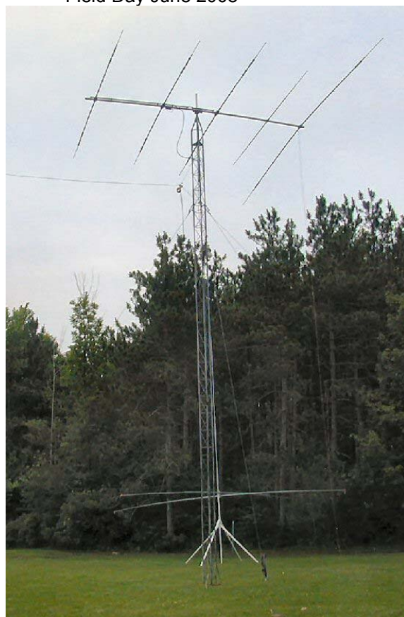
B-PLUS OCT. 2008