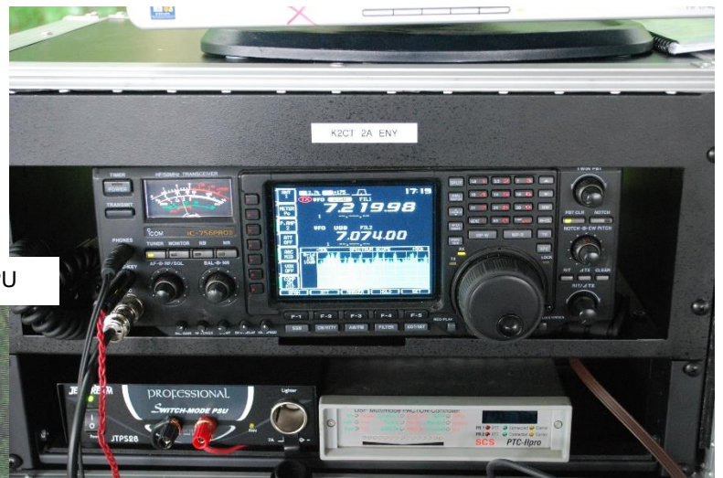
Field day 2018

Permission to reprint is granted if credit is given for article source as "Albany Amateur Radio Assoc. B-Plus"; and credit for specific bylines to the author when so identified. The contents of this publication are copyrighted in all www.k2ct.org