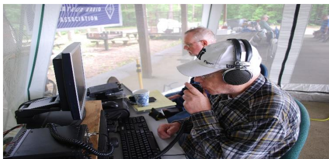
Field day 2018