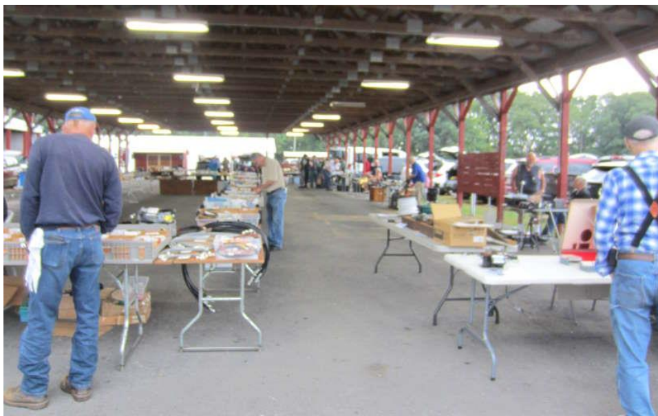
Buying and selling in the pavillion