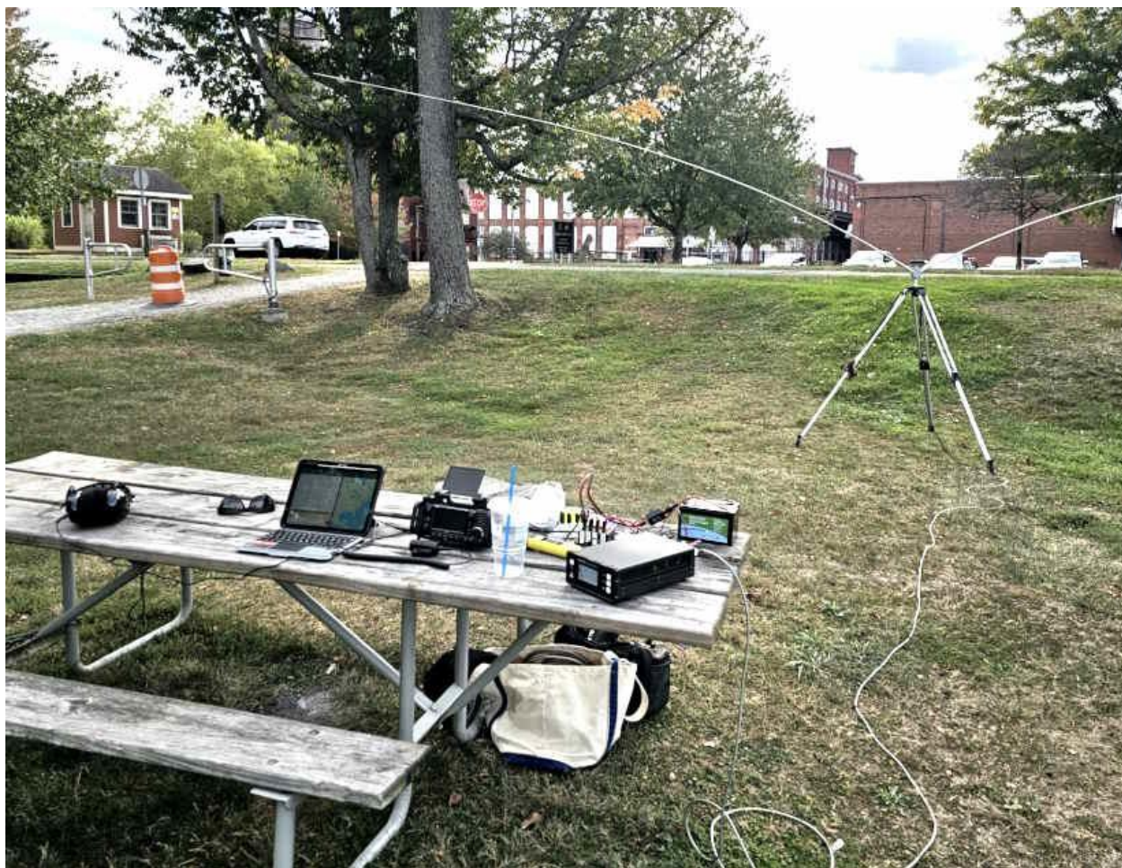
Dave KM2O setup at Peebles Island State Park. Looks pretty complete.