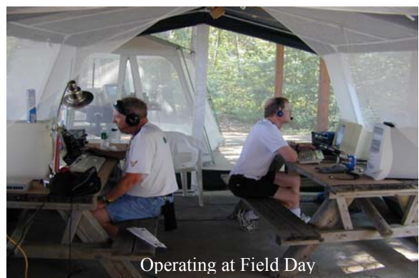
Operating at Field Day