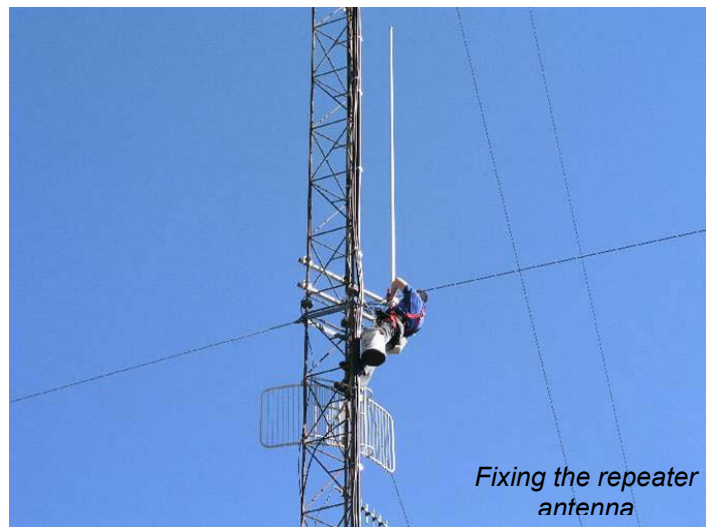
Fixing the repeater antenna