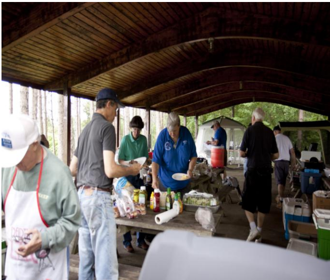
Field Day 2011

ATVET LIAISON: Gerald Murray, WA2IWW atvet@n2ty.org or 518-482-8700