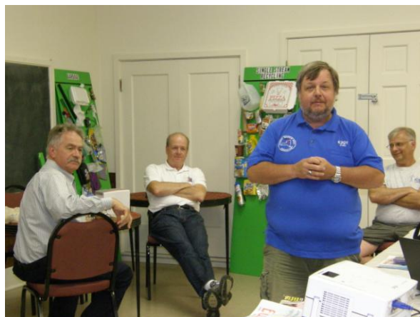
Classes